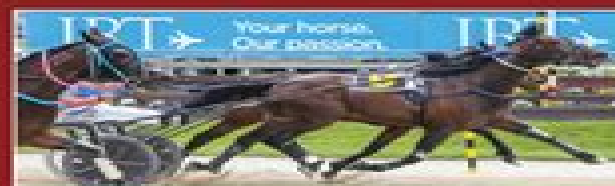
Royal Pride winning over 3200m Cup Day 2022 6 wins | $76,689 to date