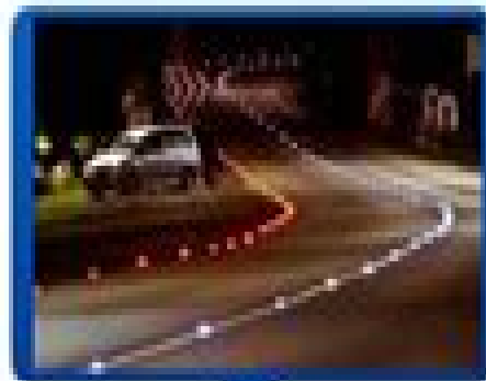
Cats Eyes (1934)