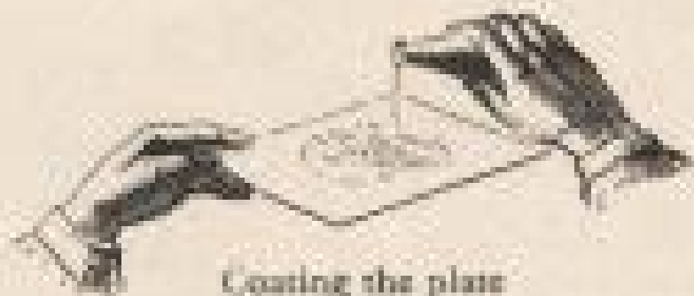
Coating the plate