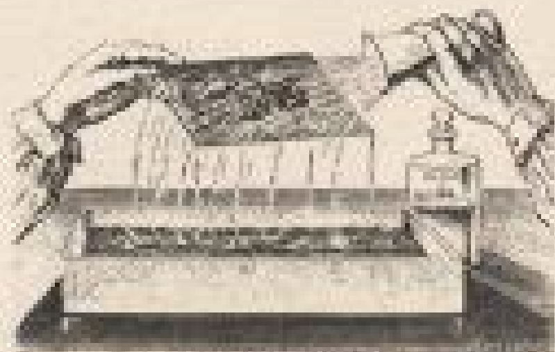
Developing the plate