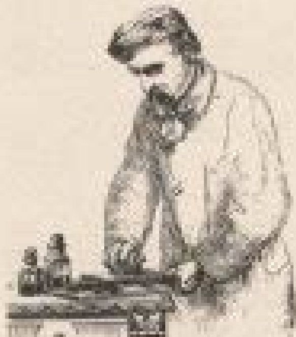
Polishing the plate