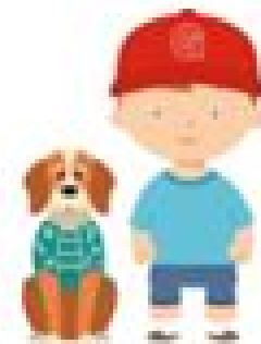
Polly Punctuation & Grammar Gabe