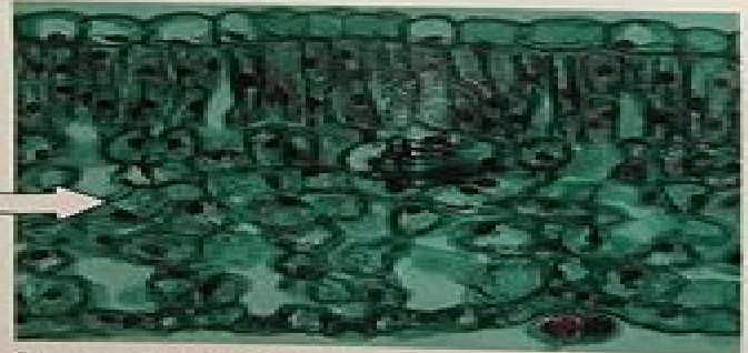
Cross-section of leaf