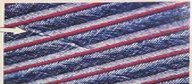
Electromicrograph of feather