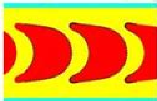
Capillary Flow of Red Blood Cells