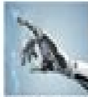
Robotics and Prototyping