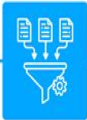
Open Storage Formats